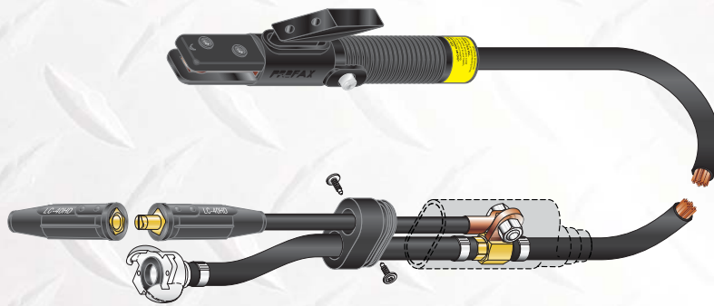
TORCH WITH AEC3-045CF INSULATION KIT INSTALLED