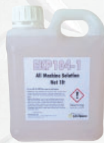
All Machine Solution EKP104-1 EKP104-5 EKP104-20