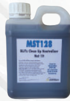
Neutraliser MST128 MST129