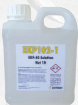
EKP-50 EKP102-1 EKP102-5 EKP102-20