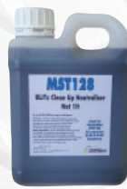
Neutraliser MST128 MST129