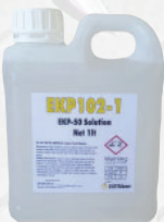
EKP-50 EKP102-1 EKP102-5 EKP102-20