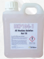
All Machine Solution EKP104-1 EKP104-5 EKP104-20