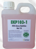
Eco-Kleen PH Neutral EKP103-1 EKP103-5 EKP103-20