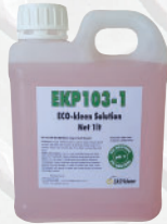
Eco-Kleen PH Neutral EKP103-1 EKP103-5 EKP103-20