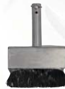
MEPI5M120W M120 Fed Brush