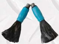
151MEP P1 Brush