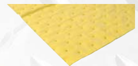
TC354 Absorbent Mat