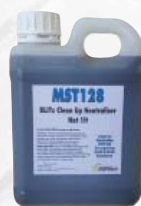
MST128 Neutraliser 1 Litre