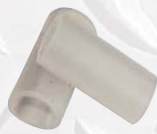
152MEP Bristle Sleeve