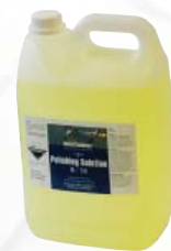
153MEP (5 litre) 153-20MEP (20 litre) B50 Polishing Solution