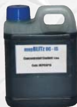
MEPI5SP10 Coolant 1 Litre