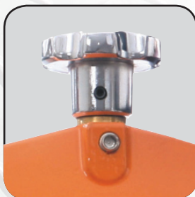
One-Touch Adjustment Chamfering Depth