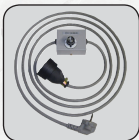
Speed Controller Protecting the inserts from wearing rate by educing RPM when chamfering stainless steel. Part No. AHASCSS