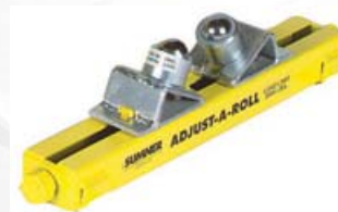
783154 - Ball Transfer Roller Head