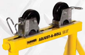
783152- Rubber Wheel Roller Head