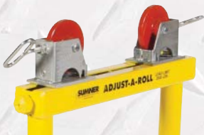
783151- Carbon Steel Roller Head 783153 - Stainless Steel Roller Head