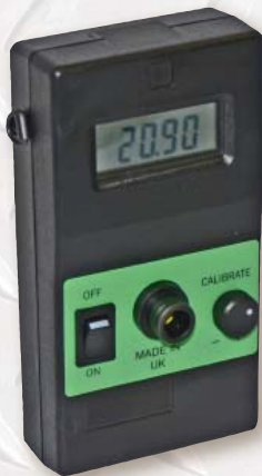
TMWGA0001 (IMAGE REFERENCE ONLY)