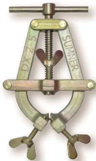
781571 2 - 5 Inch (50 - 150 mm)