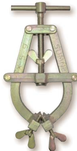
781573 5 - 9 Inch (125 - 225 mm)