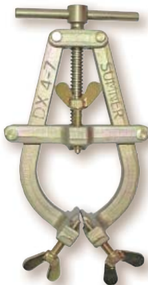
781572 4 - 7 Inch (90 - 190 mm)